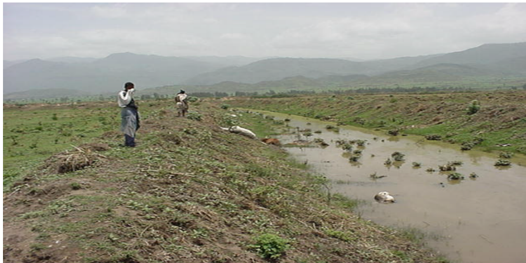
Picture 13. High number of dead cattle at Cheffa (Cheffa is called the grave yard of Afars' livestock by Afars themselves) [Photo: 29 July 2002]

According to head of zonal DPPD, relief food for June was distributed and July's ration is being transported. The quantity as compared to the affected population is not enough according to DPP committee. About 1000 quintals of supplementary food (FAFA) was distributed in June. Elders were complaining about its quality when it was tasted.