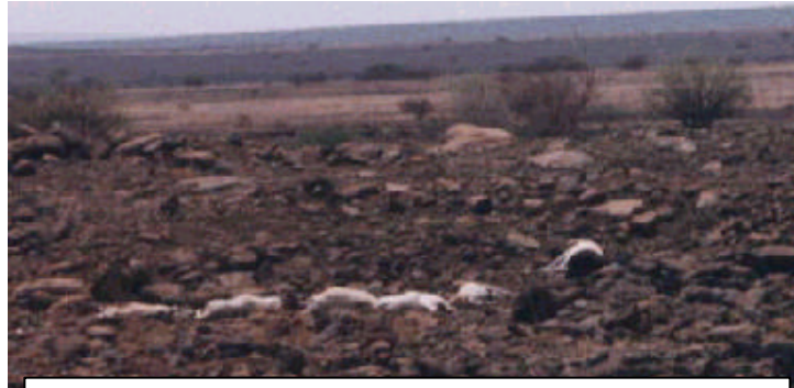
Pic. 6: Endufo (Gewane woreda): Dead sheep from cold and disease (Photo:28 July)

The team counted 8 dead sheep at one spot as documented in picture 6, and observed many more dead shep around Endufo (Gewane woreda). According to the communities, the sheep died because of the rain the previous night.