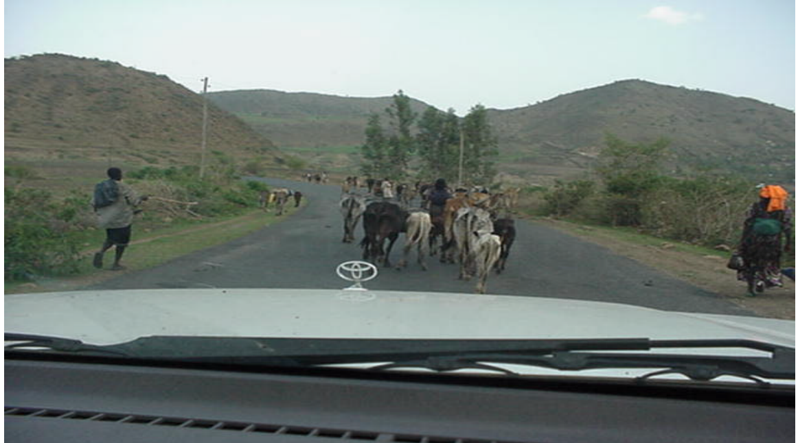
Picture 17. Pastoralists leaving Cheffa grazing area and going back to their areas. [Photo: 29 July 2002]

The team had observed a number of weak and dead cattle along the road sides (Picture 18). Pastoralists informed us that they are not sure how many of their cattle survive until they reach their homes.