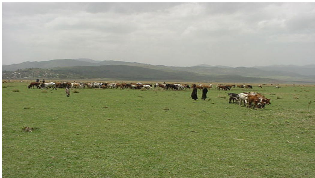
Picture 15. Cattle from Zone 5 of Afar Region at Cheffa ELFORA's grazing land. [29 July 2002]

The pasture situation in this zone started to deteriorate after the failure of last karma rain. Migration of men with their cattle from the western woredas of the zone to Cheffa area started since January 2002 while from northern and southern woredas to zone 4 and zone 3 of Afar Region respectively . The intensity of the migration got the peak point in April/May 2002. As a result the Afars that moved to Cheffa and their neighbouring Oromo pastoralists were forced to buy the grazing area of ELFORA plc on contractual basis for a period from June upto the 15 th of July. A total of Birr 102,000 (Birr 51,000 for the grass and another Birr 51,000 deposited as a guarantee in case they remain after July 15 th ) was paid. Birr 800 was paid for evry 100 heads of cattle. About 12,000 heads of livestock, predominantly cattle, concentrated in the area (Picture 15) at the initial stage according to the elders of Afar at Cheffa.