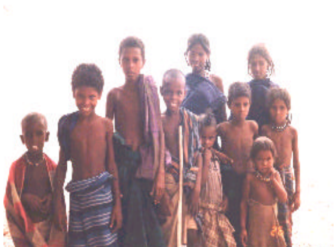
Pic. 1: Children at Glubleafa, Dubti Woreda (Photo: 26 July 2002)

amount will further be shared with those families who were not included in the distribution.