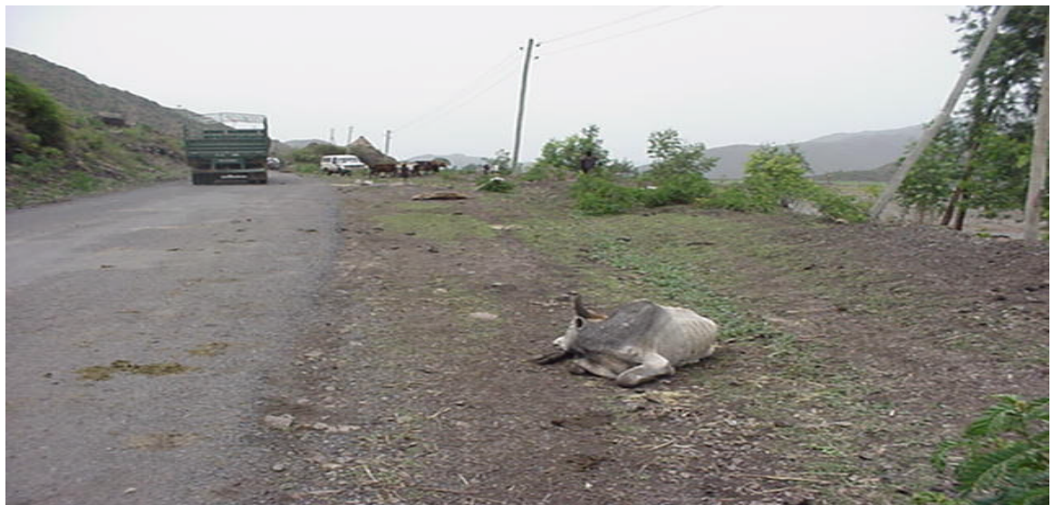
Picture 18. Dead and weak cattle along the road sides that pastoralists left behind when they were going back home from Cheffa grazing area. [Photo: 29 July 2002]

The team had observed a number of weak and dead cattle along the road sides (Picture 18). Pastoralists informed us that they are not sure how many of their cattle survive until they reach their homes.