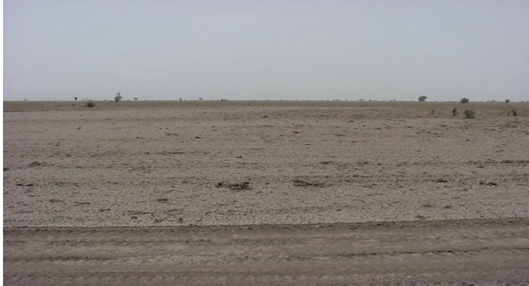
Picture 8. Situation of dry season grazing land in Ewa Woreda. No pasture is currently available at this place. [Photo: 27 July 2002]