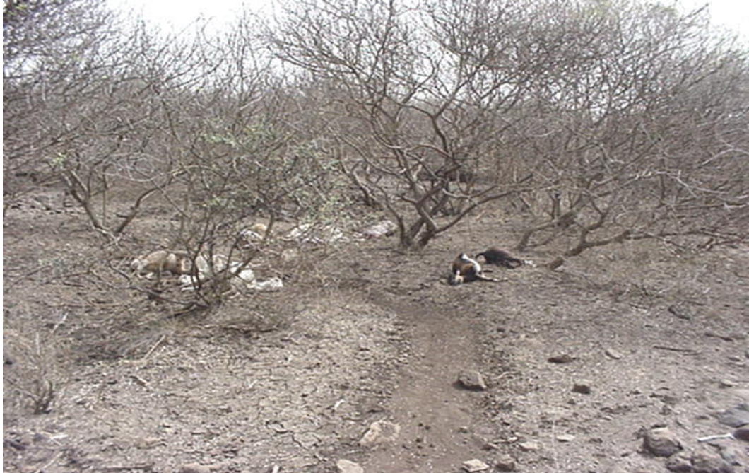
Picture 10. Dead sheep and goats immediately after the rain of July 25 th 2002 at Dalifagi Kebele. They belonged to only one family. [Photo: 26 July 2002]