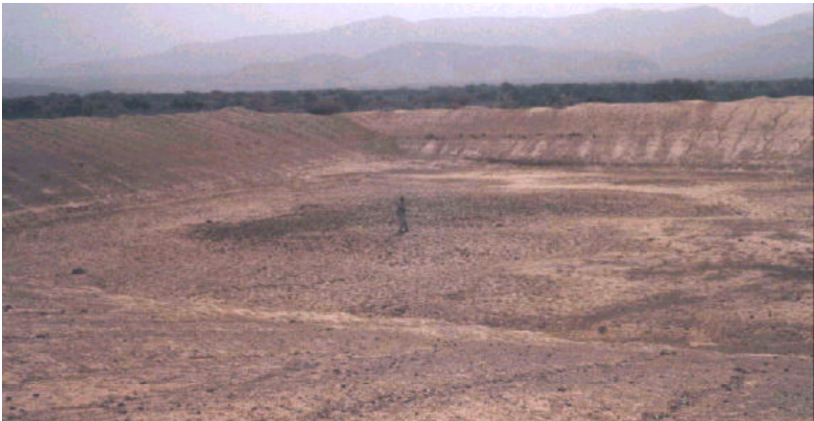
Pic. 2: One of the ponds with a capacity of 10,000 m 3 constructed by APDA at Glubleafa, Dubti Woreda (Photo: 26 July 2002)

According to UN-EUE, during their field assessment of early June 2002, they have observed ponds around Guyah being used by livestock and people who have come from the neighbouring Woredas of Elidar (zone 1) and Terru (zone 4). The following observation was also documented by the UN-EUE mission. '... In Guyah, women are carrying water on donkeys or camels upto 10 kms and beyond. The guyah water pond is expected to dry up soon...' (UN-EUE, 4 July 2002).