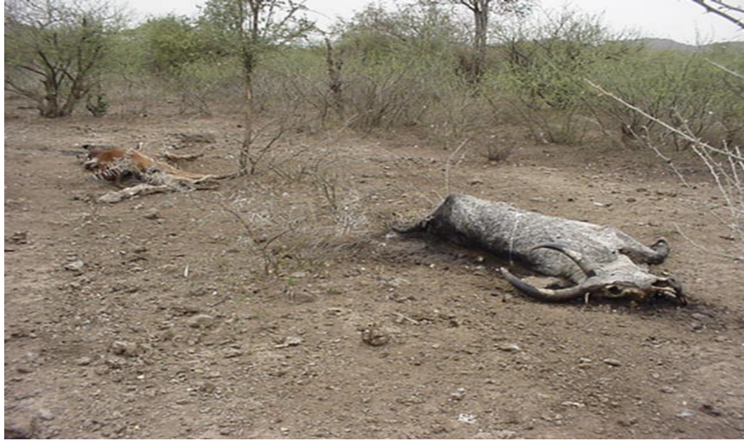
Picture 7: Some of the left behind cows became dead at Fokisa Kebele, in Golina Woreda, that were supposed to feed the remained family members (children, mothers and elders) [Photo: 28 July 2002]

According to Zone 4 DPPD head, relief food for the month of July is being transported to all woredas in the zone. The quantity, however, when it is compared to the number of beneficiaries, is not enough as per the head of DPPD. For instance for 13,341 needy communities in Golina woreda, only 595 quintals of relief food was allocated. The assessment team observed the transportation of relief food to Teru, Awra and Golina woredas. No supplementary food was included in the relief food and distribution of the food was not started yet. Access to the sites is the major problem. The assessment team was forced to travel additional 243 kms to reach to Kalwan (the zonal town) because of the inaccessibility of Kalwan river due to flood. The trucks that were loading the relief food to Teru woreda also faced similar problem. The relief food for Golina woreda was unloaded at Fokisa school compound which is 20kms before Kalwan on the way from Kobo to Kalwan.