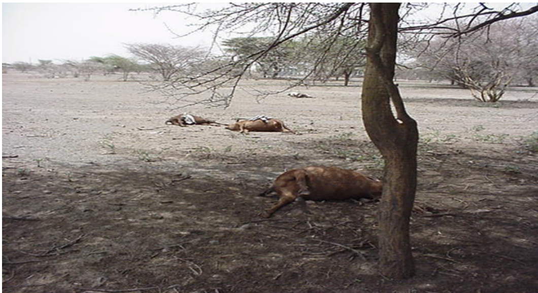
Picture 11. Dead sheep, goats and calves near Dalifagi. [Photo: 26 July 2002]