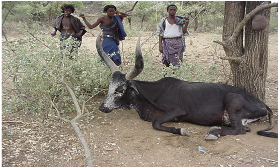
Picture 9. Coping mechanism of pastoralists during scarcity of pasture for their cattle at Fokisa Kebele. [Photo: 27 July 2002].