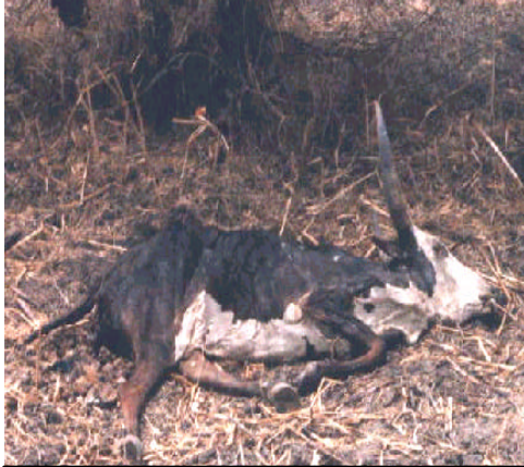
Pic. 3: Dead cow , Afambo (Photo: 26 July 2002)

As the rain in some areas has started and people are collecting rain water from where ever available around their area, there is a high risk of water contamination. Communities also reported this as a major threat to their health situation. The health institutions in the area, as well as local authorities expressed their concerns about a potential human disease epidemic as a result of contamination of water by the dead livestock. All of the dead livestock observed were were not skinned, because communitis suspect transmigration of disease from the dead livestock to people.