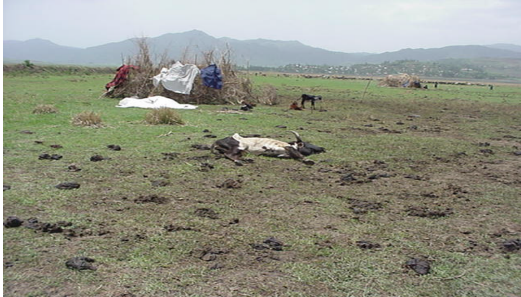
Picture 12. Freshly dead cow at Cheffa grazing area. [Photo: 29 July]