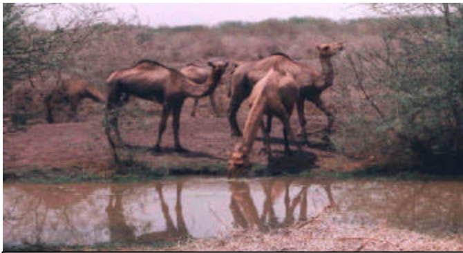
Pic. 4: Camels drinking water from canals, Afambo (Photo: 27 July 2002)

There is an agreed schedule for watering the goats, cattle and camels which is every 2, 4 and 7 days respectively. According to observation of the community, camels used to stay for more than 10 days without water, which is not the case any more.