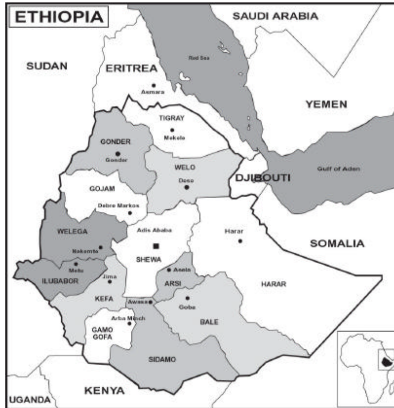
Figure 1: Map of Ethiopia showing the regions and positions of neighbouring countries