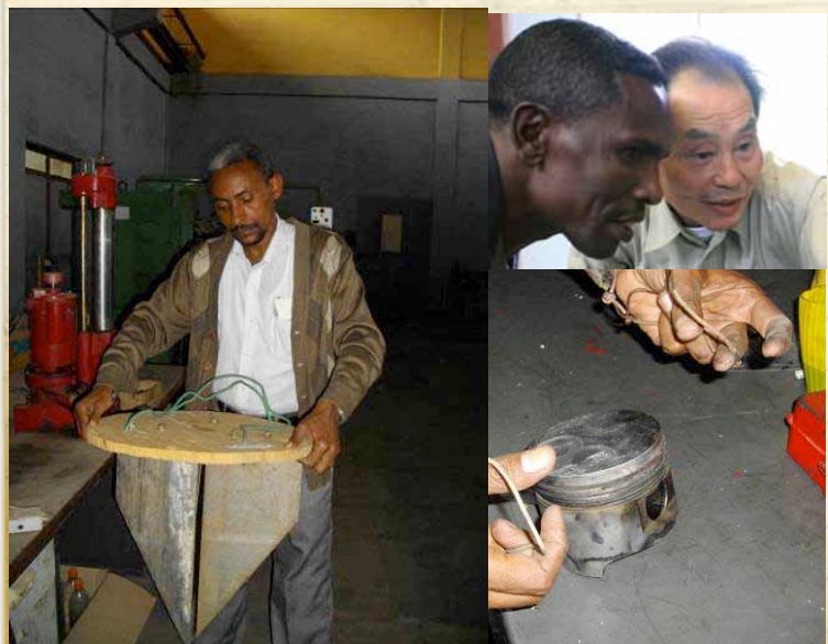
An example of tool of their own making

The coordinators and instructors are regularly interviewed as part of capacity building of EWTEC staff. That is called "Capacity Improvement System (CIS).