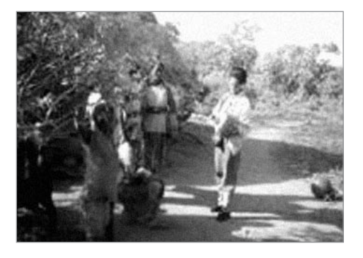
Figure 1 The Moringa stenopetala tree grows widely in southern Ethiopia.

Among the main staple crops of Ethiopia are maize, sorghum, teff (a native grain somewhat similar to millet) and wheat. People also exploit other indigenous plants, including wild banana ( Ensete ventri cosum ), eating the starch-containing pith of the stems, and Moringa trees, the leaves of which have a distinctive strong, mus-